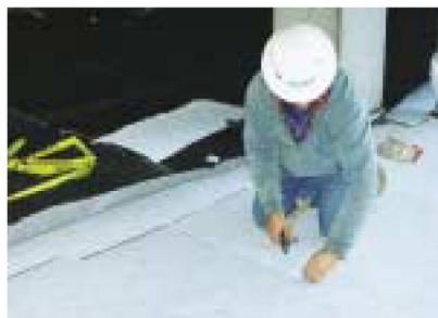
Preparing to complete installation of Enkamat 7918R over Enkasonic.