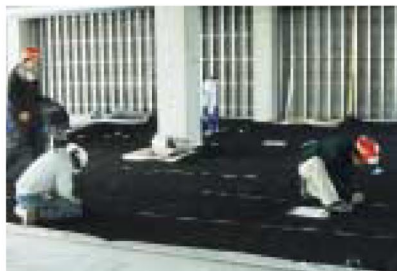
Luxury condominiums will have stained concrete finished floors.

Resonant Frequency - All materials have a resonant frequency - a frequency at which sound is amplified rather than filtered. The goal of any sound control mat is to lower the resonant frequency outside of the audible range (below 100Hz or above 3000Hz.) Enkasonic has been tested and rated with a resonant frequency of 46.8 Hz. Well below the audible level for all but the family dog!